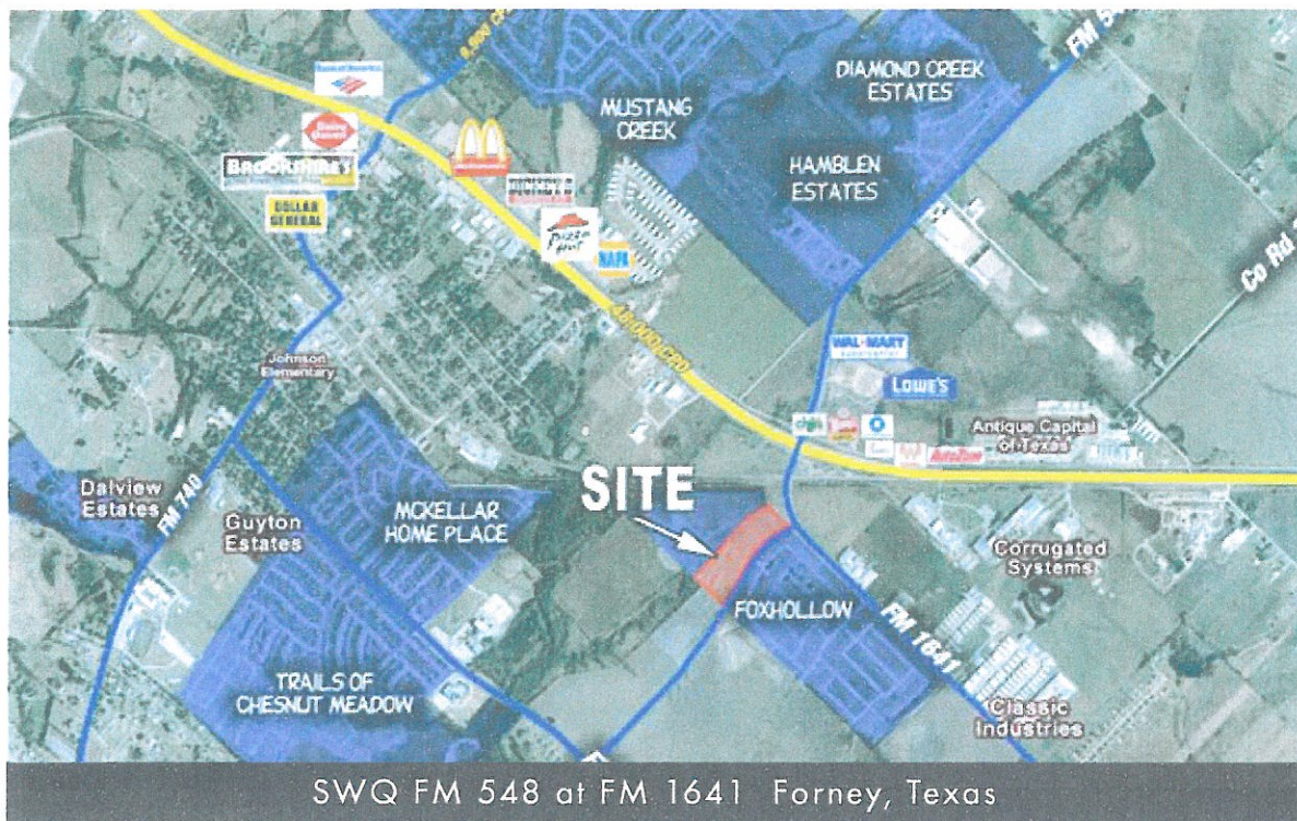
SWQ FM 548 at FM 1641 Forney, Texas